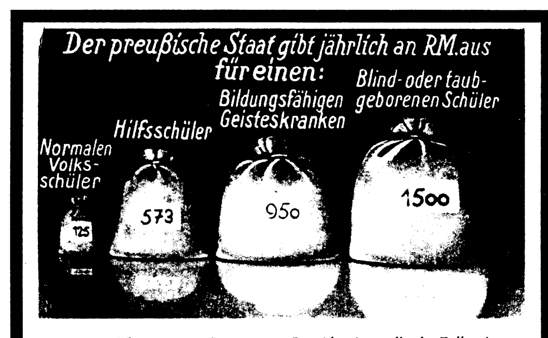
Figure 36. "The Prussian Government Provides Annually the Following Funds for: a Normal Schoolchild (125 RM); a Slow Learner (573 RM); the Educable Mentally Ill (950 RM); and Blind or Deaf-Born Schoolchildren (1,500 RM)." This illustration depicts the burden of maintaining the socially unfit. From Volk und Rasse, 8(1933): 156.

Hitler was petitioned by some parents to kill their disabled children. The Knauer Child in 1937 became the first and the beginning of a much more sinister plan to be launched as war broke out. First clearing the hospitals of long term disabled inmates and then extending much wider.